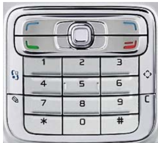
Figure 2: S60 – Interface to input data

While our project was going on, Wahlig [2007] published a version of Ped (Python editor) for the Operating System (OS) S60 3 rd edition of mobile phones – a kind of Integrated Development Environment (IDE) for Python on the mobile that fulfils our project requirements best. To sum it up: when it comes to mobile programming we used the elements which are documented in table 1. This project could only be carried out, because our school received thirty mobile phones (three different types – namely: 5500 Sport, E61i, and E65 – Nokia) to run the course.